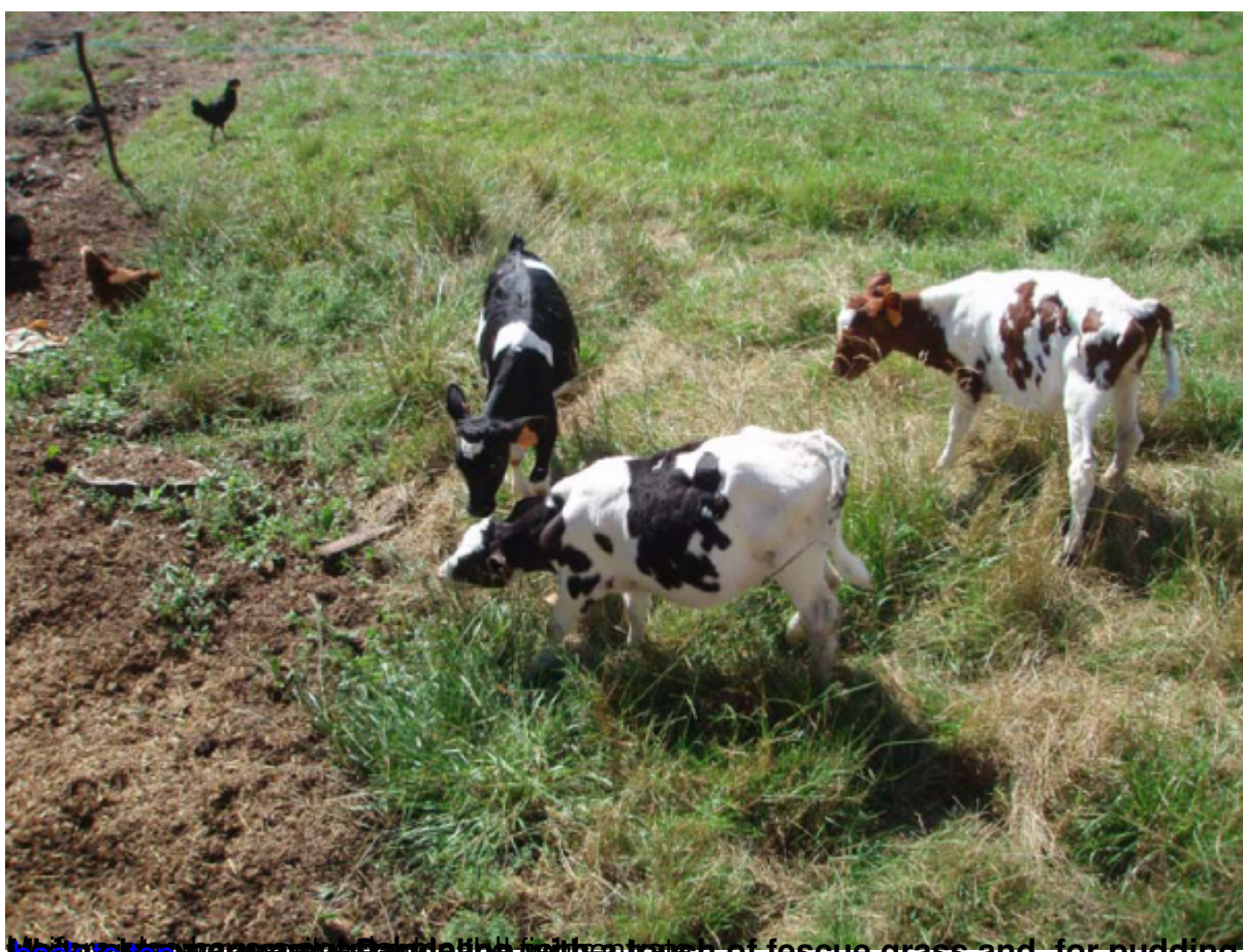
dentification and general general description is the state of the scue grass and, for pudding, a bite of