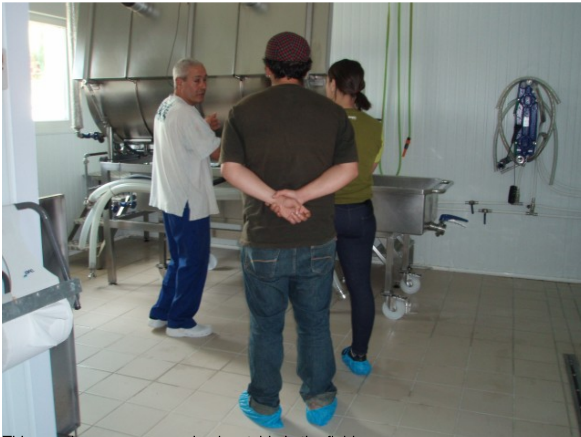
This is the Broomfield cowshed, the side of the field - a dairy farm in Bizkala