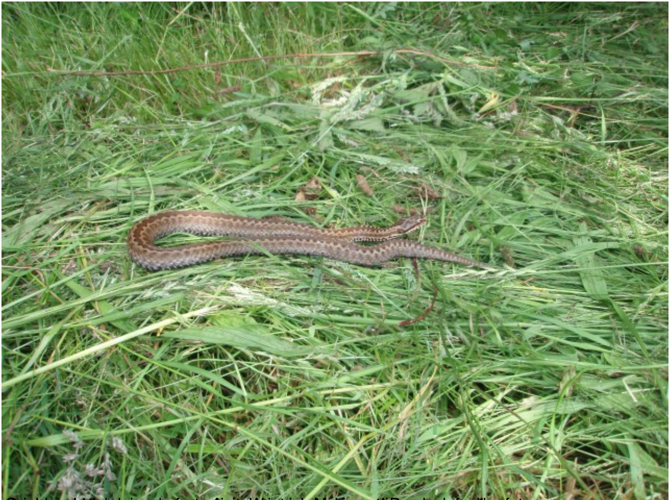
On the left, bird at a window, to the right, a snake in a field. A group of people are also in the future.