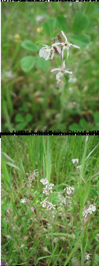
at the Broomfield cowshed, the side of the field - a dairy farm. As with other