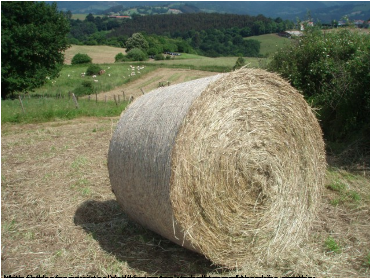
Many fields are irrigated with canals, but the water is not always clean and the quality of the water is not always good.