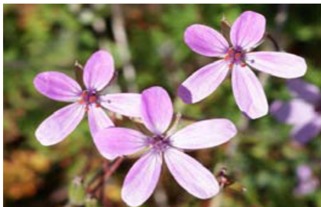
Common stork's-bill ( Erodium cicutarium )